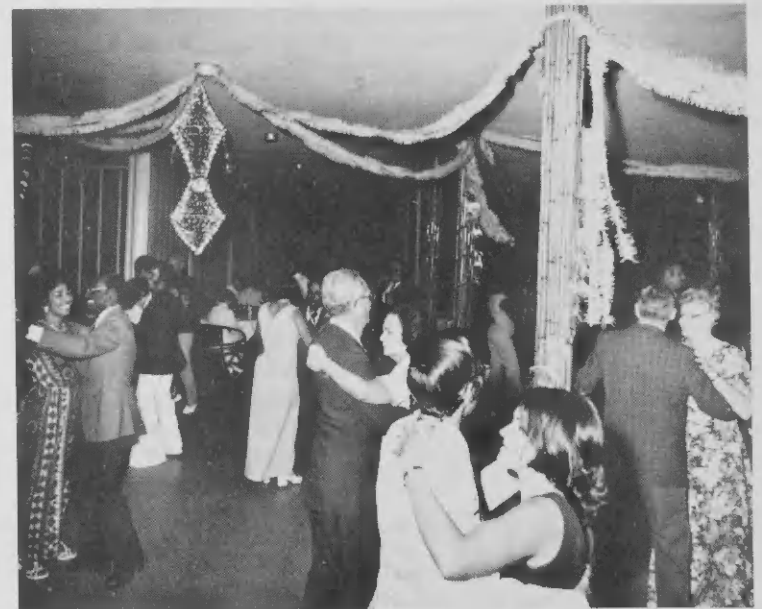
Highlight of the 25th anniversary of the Esso Club facilities was a buffet-dinner and dance in the festively decorated Bamboo Room December 7.

E presente Esso Club, durante tur su 25 anjanan, a sirbi como e lugar pa recepcion y banquetenan pa honra personalnan real Hulandes, oficialnan di Gobierno y otro dignatarios local y extranhero. Ademas, e facilidadnan a contribui altamente na e desaroyo industrial, cívico, atlético, creativo y social di su miembronan y awendia tambe ta un centro di recepcion pa bishitantenan local y turistanan durante nan gira den refineria.